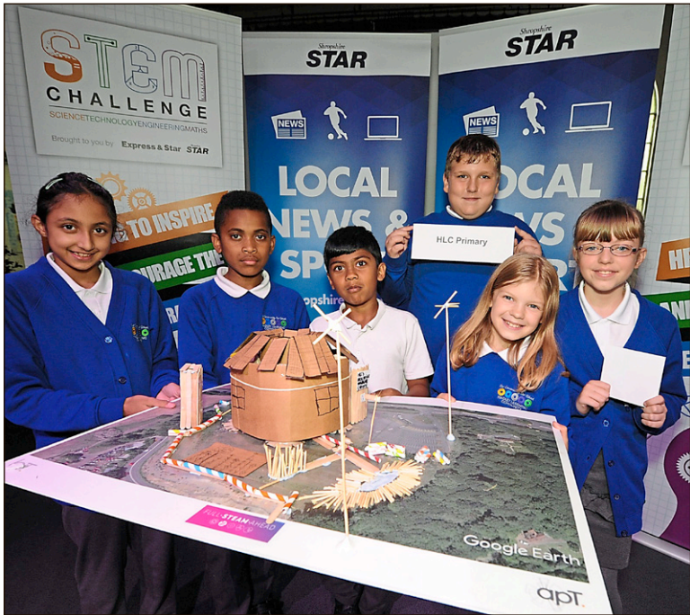
Best Design winners – Youngsters from HLC Primary School in Telford