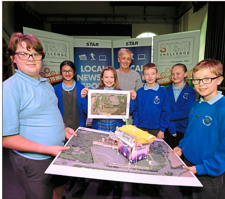
Best Planning winners – Students from Apley Wood Primary School