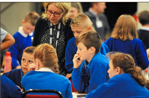
Fun and thought-provoking – The Stem challenge encourages children to think about engineering while working together as a team