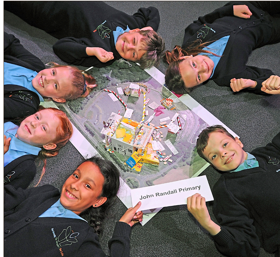
Pupils from John Randall Primary School celebrate after being named the overall winner of the Stem Challenge event

taken by Radbrook Primary School, with the best design category being claimed by Hadley Learning Community Primary. Other schools taking part on the day were Donnington Wood, Our Lady & St Oswald's, Stoke-on-Tern, and Wrockwade Wood Junior School. The event was sponsored by Telford & Wrekin Council, bit, and apt. 7 Video also filmed at the event for a film that will be featured on the Shropshire Star website and social media channels in the near future. Key to the event was the support of Northwood Hygiene Products, which provided some of the materials used by the children in their designs.