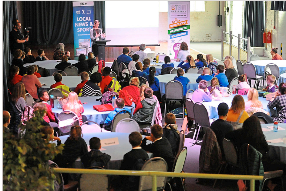
The Stem Challenge was hosted by the Enginuity technology centre in Coalbrookdale

taken by Radbrook Primary School, with the best design category being claimed by Hadley Learning Community Primary. Other schools taking part on the day were Donnington Wood, Our Lady & St Oswald's, Stoke-on-Tern, and Wrockwade Wood Junior School. The event was sponsored by Telford & Wrekin Council, bit, and apt. 7 Video also filmed at the event for a film that will be featured on the Shropshire Star website and social media channels in the near future. Key to the event was the support of Northwood Hygiene Products, which provided some of the materials used by the children in their designs.