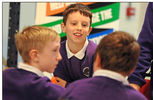
Fun and thought-provoking – The Stem challenge encourages children to think about engineering while working together as a team