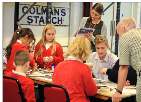
Fun and thought-provoking – The Stem challenge encourages children to think about engineering while working together as a team