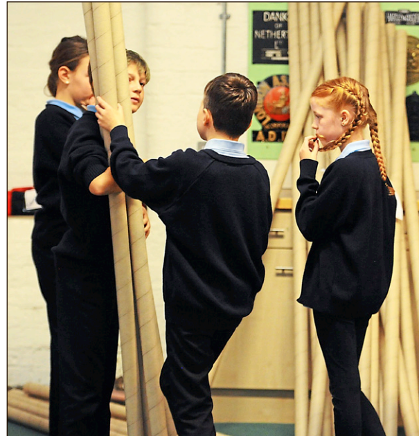
Students collect material to create a concept model