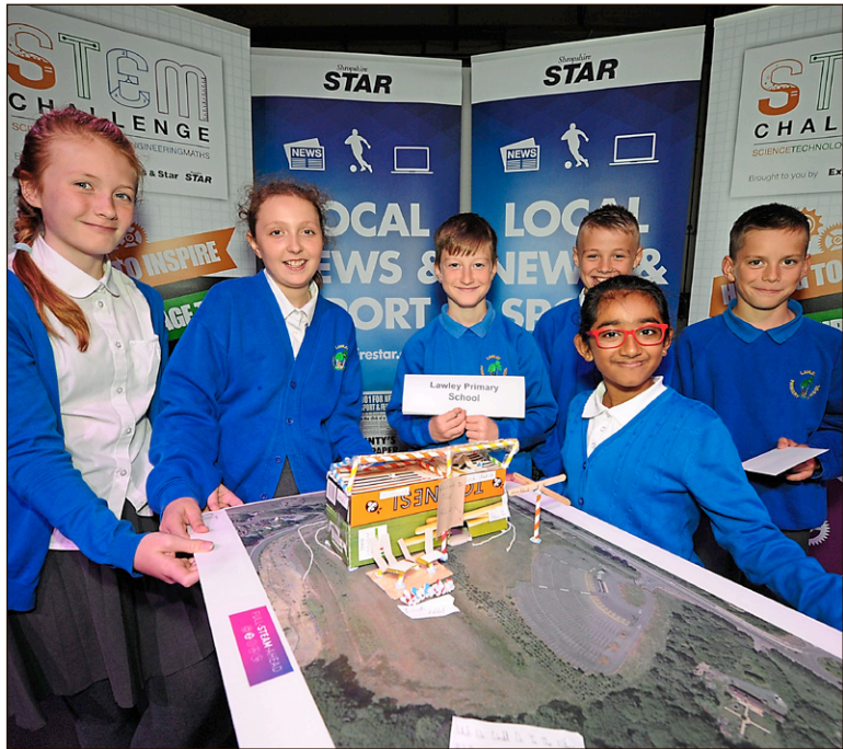
Best Problem Solving winners – The team from Lawley Primary School